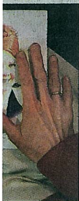
s her hand over gram.